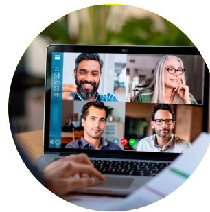
Our in-house team

The ZPen team is employed by the Group and works in line within the Group's operational model. Therefore, the in-house team is aligned with the Group's 2030 operational net zero target.